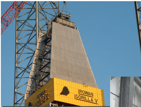
Mini Heatshields protecting the Gorilla V derrick Structure

Mini Heatshields used to enclose an escape route at Ineos Grangemouth processing plant.