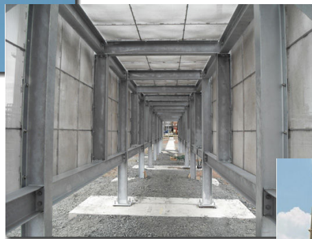
Mini Heatshields protecting Boom Hoist Control Point

Mini Heatshields used to enclose an escape route at Ineos Grangemouth processing plant.